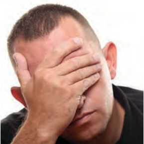
Mental Health Services